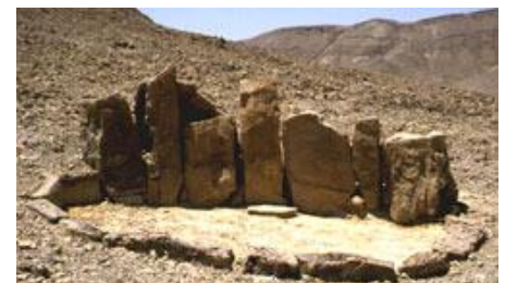
Ancient Stone Altar Site in Negev Desert

e. How does the near-sacrifice of Isaac "foretell the Christ"??